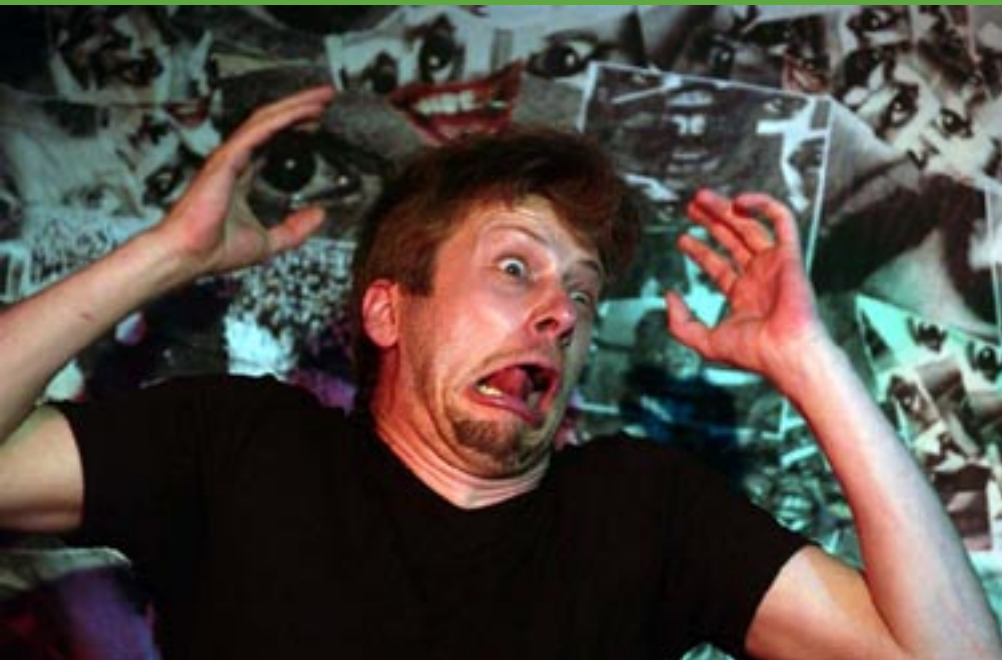
FoE Comedy Benefit 19th July.