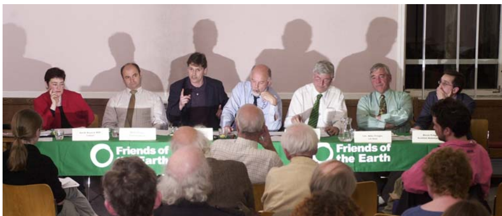
FoEE Edinburgh's successful Scottish Election Hustings in April 2003